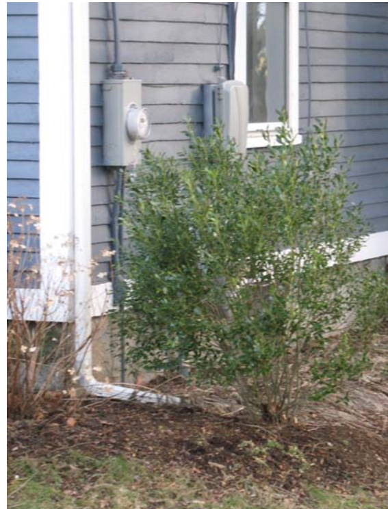
Gas meter obscured by shrubbery.