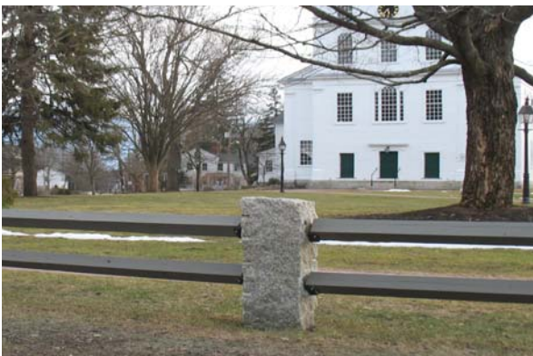
Double split-rail fence, with granite posts.

Landscaping should be considered to relieve the visual impact of long fences.