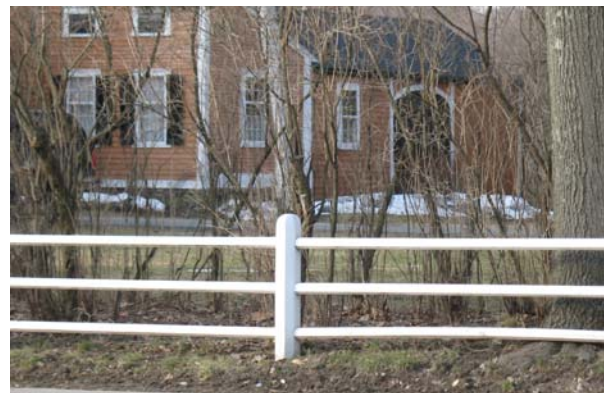
Triple split-rail fence, with wooden posts.