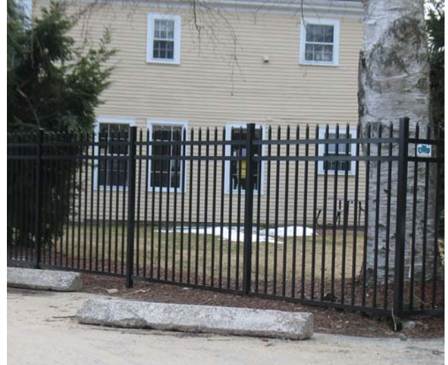
Anodized aluminum fence, painted black, 60” high