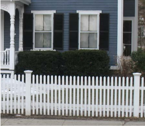
Wood picket fence, 42” high, with wooden posts.