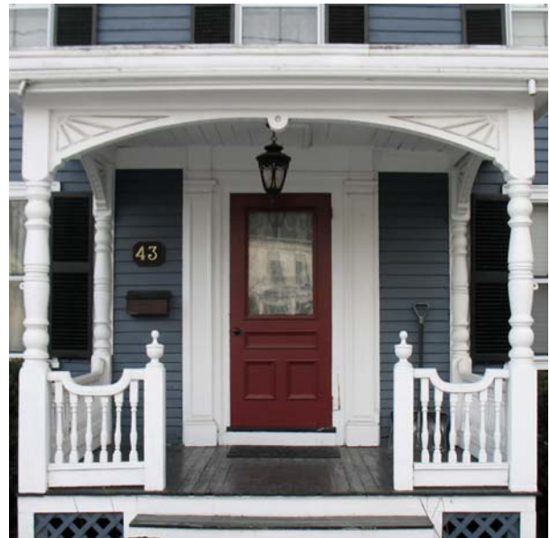
Victorian entry with wooden storm door.

Doors marked as “Colonial” with a crossbuck on the bottom half and scalloped frame around the upper window are not appropriate to historic buildings.