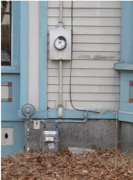
Modern equipment not obscured from view.

Ground-level equipment such as gas and electric meters and air-conditioning compressors should be installed on the side or rear of the building if possible, and shrubbery should be planted to shield them from public view.