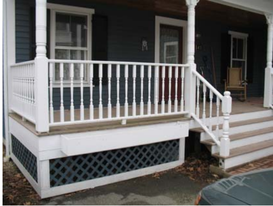
Porch with railing – new construction.