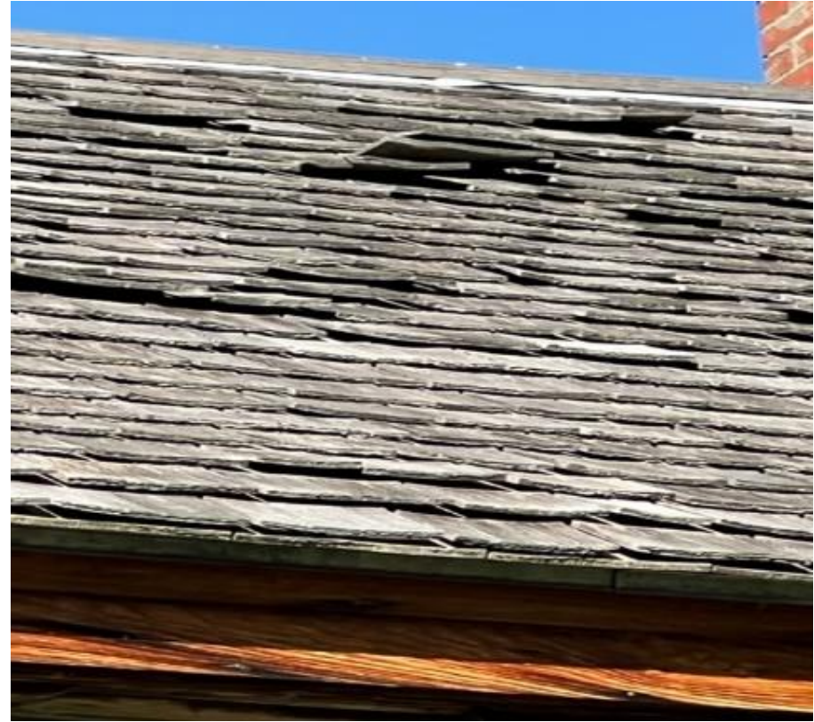
Job Lane House Roof Current Condition